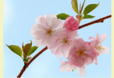
D - Japanese Cherry Blossom A blend of pink Japanese cherry blossoms and fragrant mimosa flower petals,