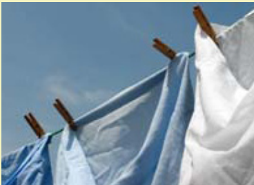
E - Clean Cotton Nostalgic aroma of fresh linens dried on a fresh breezy day.