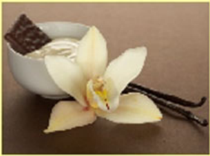
A - French Vanilla: A rich French vanilla aroma

Available in 12 Favorite Scents and Pastel Colors $15