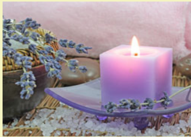
B- Lavender Luxury A lavender lover's dream! A tranquil combination of fresh herbs and cool camphor..