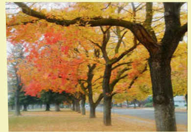
H - Autumn Magic Autumn magic starts with lemon and apple; followed by anise, cinnamon, and ginger