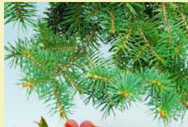
J - Balsam & Cedar A camphoraceous woody blend of pine, eucalyptus, cedarwood; finished with sweet balsam