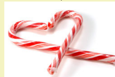
K- Candy Cane A combination of fresh peppermint leaves, sweet ripened strawberries, on a dry down of vanilla.