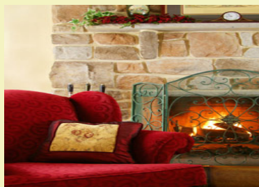
F - BDS Home Sweet Home Spicy (cinnamon and clove) with rose and ylang ylang.