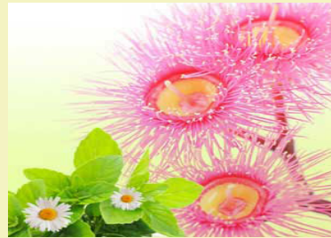
B - Eucalyptus & Spearmint A blend of eucalyptus and spearmint with fresh citrus lemon, lavender flowers, and a hint of sage.