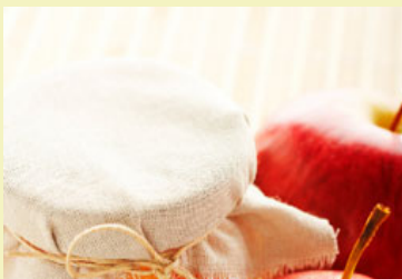
I - Pumpkin Apple Butter will put you in the mood for the holidays with orange, apple, pear, pineapple, and cherries;