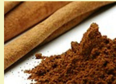
G - Cinnamon stick A Best Seller! The aroma of freshly ground cinnamon bark